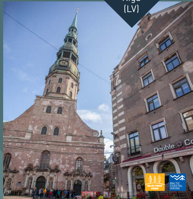
Old Town Riga (LV)