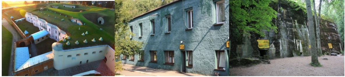
Photos: 9.th. fort at Kaunas, Hotel at Wolfschanze, Hitler's bunker in Wolfschanze