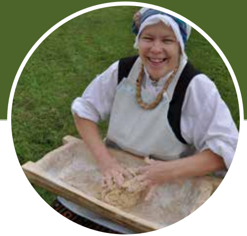
Celebrating traditional festivities