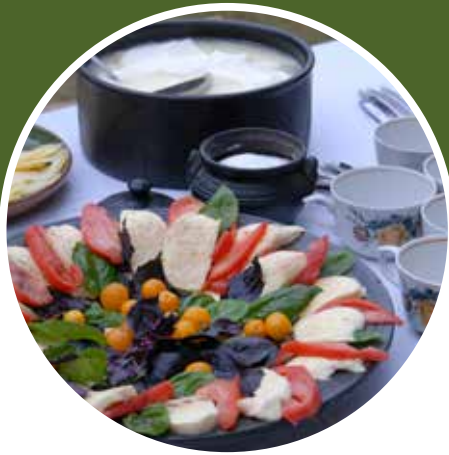
Tasting food and farm products

Traditional farms and artisans show the true spirit of the country demonstrating the living traditions in households: