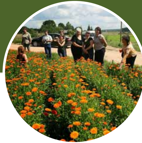
Learning herbs and nature