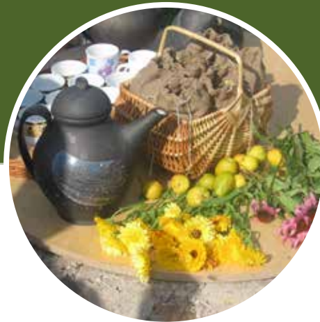
Small scale farming