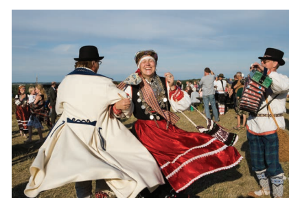
Overnight in Mārcienas SPA hotel at Madona www.marciena.eu

Setomaa in South-East Estonia is a unique area for its people (the Seto) and culture. A very specific type of singing - leelo has been inscribed into the UNESCO Representative List of the Intangible Cultural Heritage of Humanity. Visit traditional Obinitsa farmstead www.visitsetomaa.ee