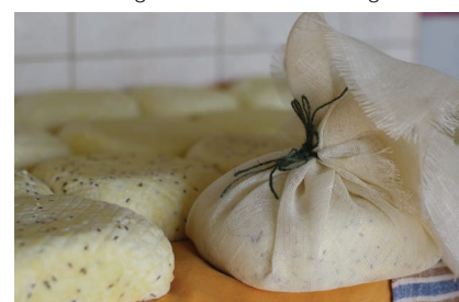
Dairy farm Celmi www.celotais.lv/lv/e/ celmi_majas_siers uses milk from its own

Riga city tour. The Dome Cathedral with one of the world's largest pipe organs, St. Peter's Church with magnificent views of the city from its steeple, the old Guild Houses, the Swedish Gate, the architectural ensemble Three Brothers, St. Jacob's Church, the Parliament House, Old Riga Castle, Art Nouveau area. The Historic Centre of Riga is a UNESCO Heritage Site.