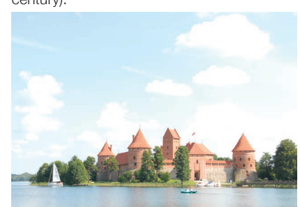
Trakai Castle. The picturesque castle was built on an island in the lake (14th - 15th century)

Karaites' cultural heritage museum (ethnic group of Turkish speaking Crimean Tatars who settled here in 14th - 15th century). Traditional Lithuanian food in Trakai: www.kibinas.lt/ Overnight in a hotel in Vilnius.