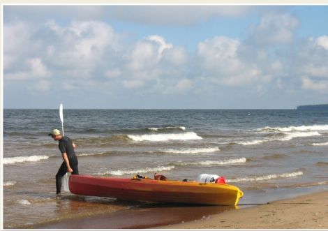
Starting the trip on the beach at T ja

11 The Salaca River is important for salmon breeding and the second most popular water tourism route in Vidzeme (see the Salaca route). Salacgrīva is at the lower end of the river.