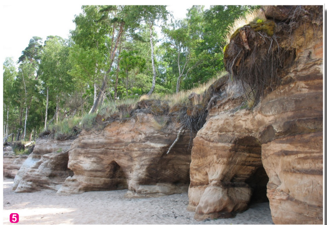
The Veczemes cliffs

The rocky seashore of Vidzeme is covered with rocks of different sizes, and there are different little capes and bays along this phase of the eastern shore of the Bay of Rīga. Between Tūja and the estuary of the Vitrupe River, you will find the only place in Latvia where the abrasive waves of the sea have unveiled Devonian sandstone cliffs that are several metres high. One of the best examples of this are the Veczemes cliffs, which are a bit less than 500 kilometres long and up to four metres high. The area around the cliffs has been improved. The shoreline is very variable and dynamic here, particularly after big storms. The Rocky Vidzeme Seashore Nature Reserve has been established to protect the area. The territory is part of the Northern Vidzeme Biosphere Reserve.