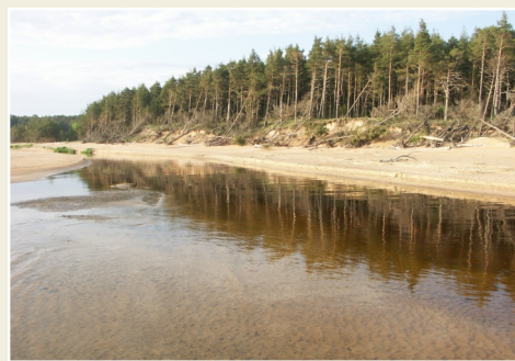
The Vitrupe River estuary