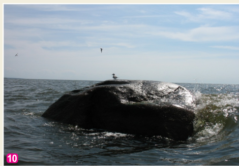
The Great Kraujas rock