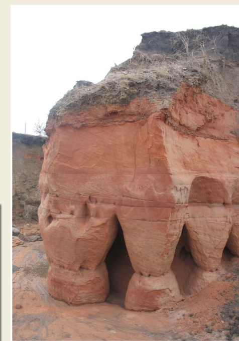
The T ja cliff