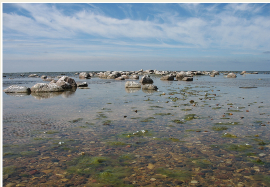
Rocks along the seashore