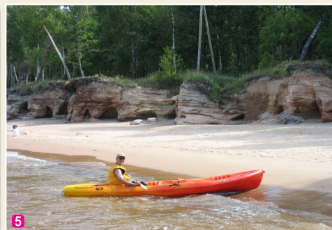
The Veczemes cliffs