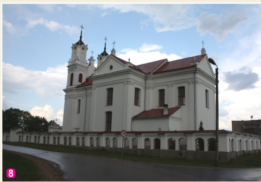
The Dviete Catholic Church