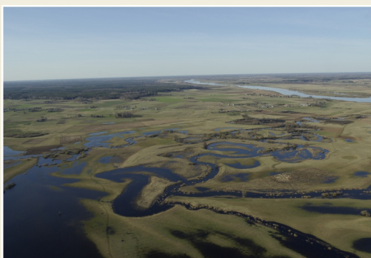
The Dviete wetlands from a bird's eye view