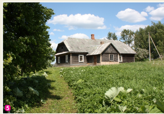
The "Gulbji" information centre in Dviete