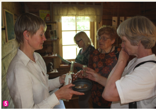
Tasting a beverage made of beaver glands