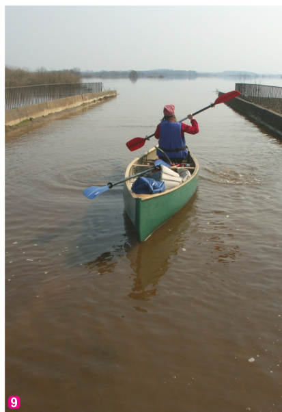
The bridge at Munči

Information: www.celotajs.lv , 67617600 www.ilukste.lv , 65440826, 26555275 www.dviete.lv www.bebrene.lv , 65407909; 26109353