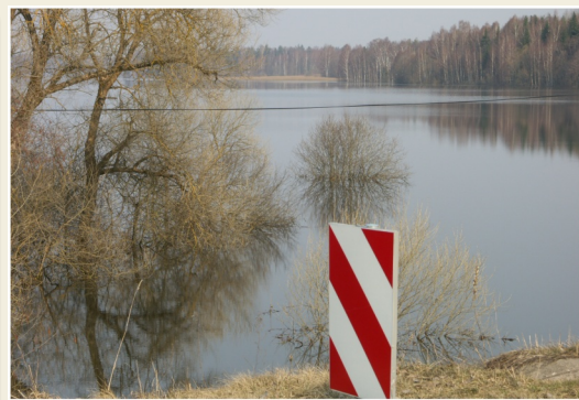
The Dviete River at the village of Dviete