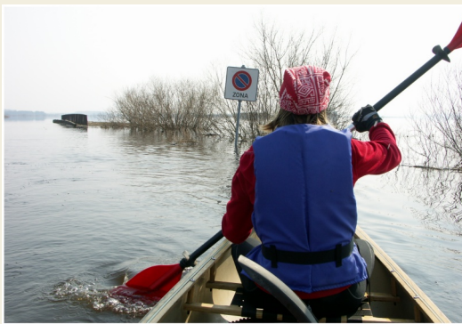
The Dvietes wetlands at the bridge of Munci