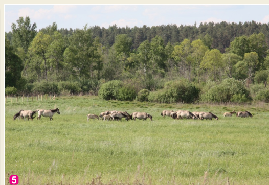
The livestock paddock