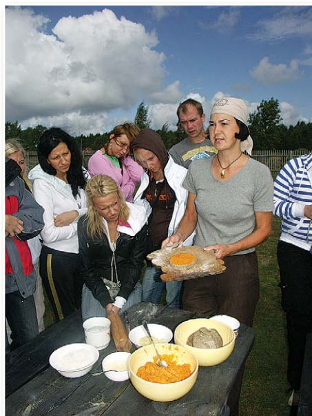
Traditional carrot buns “sklandu rauši”