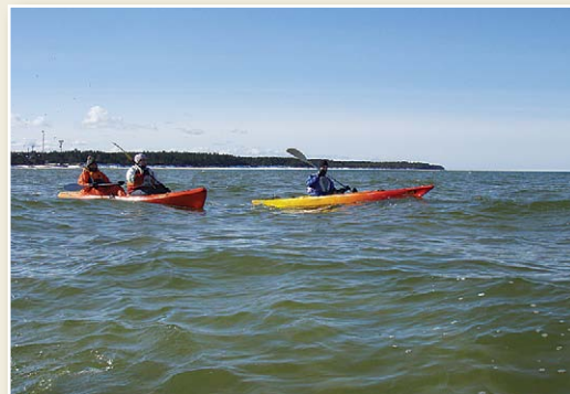
Boats on the way to the Kolka lighthouse