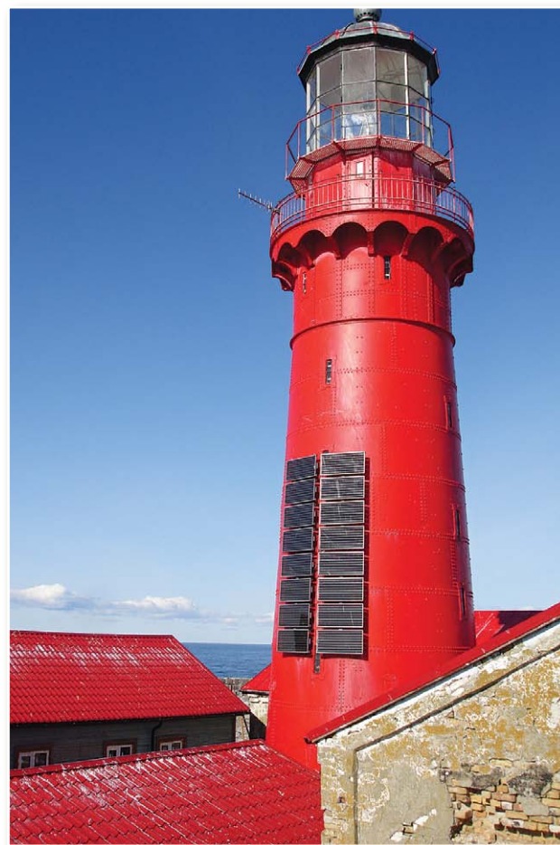
The Kolka lighthouse