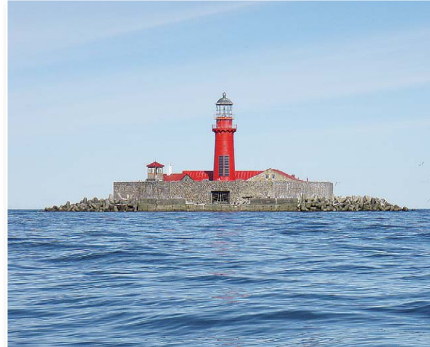
The Kolka lighthouse

By fishing boat you can go around the Cape of Kolka or the Kolka lighthouse. The route takes about 1 hour. Boats with 10 seats or with 4 seats are available. There is an option to take part in fishing with nets or traditional plaice fishing with ropes. Tasting smoked fish on the shore. Reservations: sea captain Visvaldis Feldmanis in Kolka, tel. 28327142.