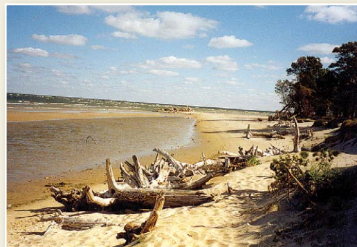
The seashore by the “Ūši” homestead