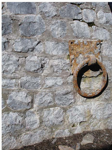
The stone wall of the Kolka lighthouse