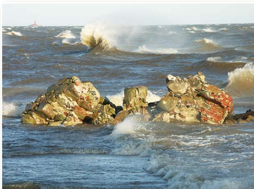
Storm in the Cape of Kolka