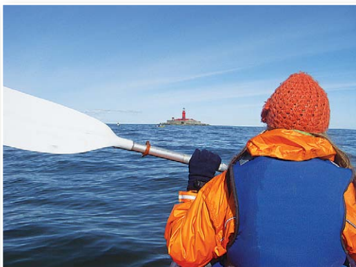
Approaching the Kolka lighthouse

4 The Kolka lighthouse is on an artificial island which was created between 1872 and 1875. The original lighthouse was made of wood, and its light was first lit in June 1875. As the island settled into the sea, the current tower was built. It began operations on July 1, 1884. Today the lighthouse is six kilometres from Kolkasrags at the end of its sandy shallows (back when it was built, it was just five kilometres away). The island still has the building for the lighthouse supervisor, as well as several outhouses. The metal lighthouse which is there now was built in St Petersburg. It has been an automated lighthouse since 1979.