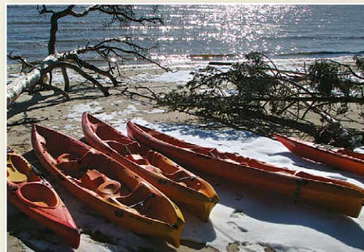
Boats at the Cape of Kolka