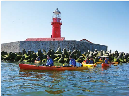
Boating group by the lighthouse