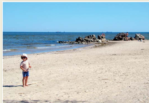
The Cape of Kolka