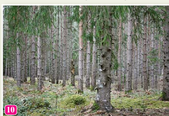
The Kaziņmežs forest