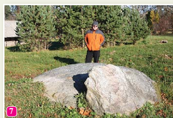
The Black Plague rock at the church