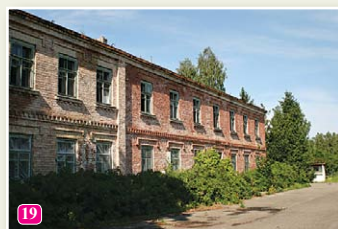
The former Maritime School