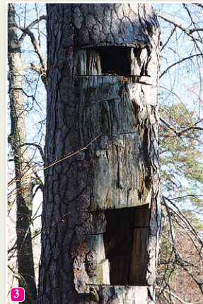
The secular pine tree