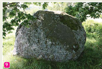
The great Black Plague rock