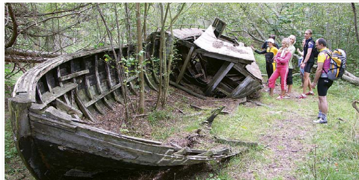
The Boat Cemetery