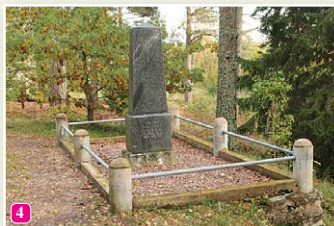
The Old Taizelis monument