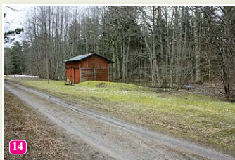
The old narrow-gauge railroad