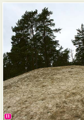
The White Dune