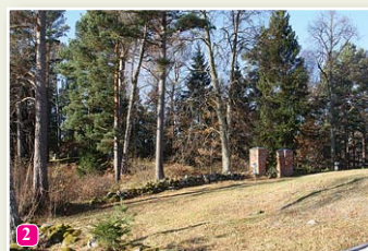
The old burial mound