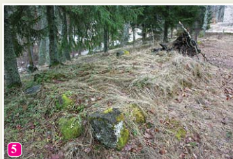
The werewolf's grave