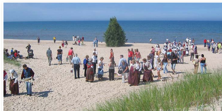
On the seashore at Mazirbe