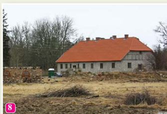
The former parsonage dwelling house