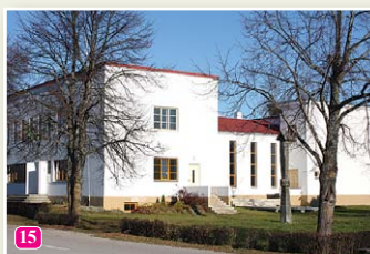
The Liv People's Centre