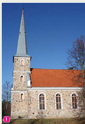
The Mazirbe Lutheran Church

22 The location of a former saloon on the side of the Mazirbe-Cirste road in Ūbeles.