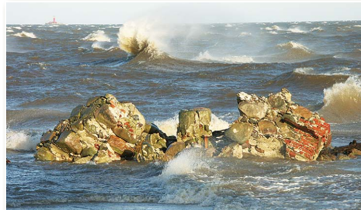
Storm at Kolkasrags