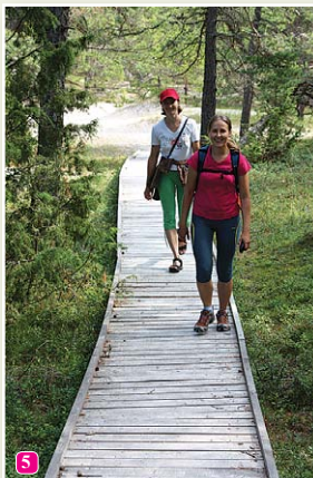
The Kolkasrags Pines trail