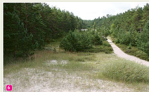
The shooting range