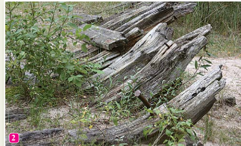
The wrecked ship