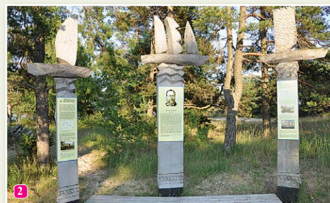
Information stands dedicated to the founder of Latvia's maritime industry, Krišjānis Valdemārs