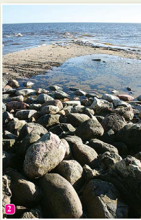
Kolkasrags (the Cape of Kolka)

6 A shooting range which isn't really there anymore, but it was once used for training purposes by the Soviet military. Right now you will see an overgrown area of land which stretches from the seashore to the Kolka-Ventspils road. That's where the shooting range was located.