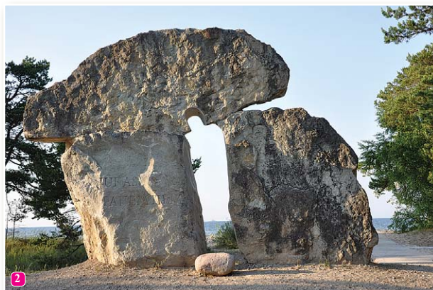
The monument to "Those Taken by the Sea"