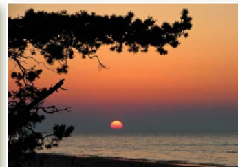
Sunset at Kolkasrags