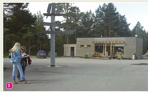
The Kolkasrags Visitor Centre