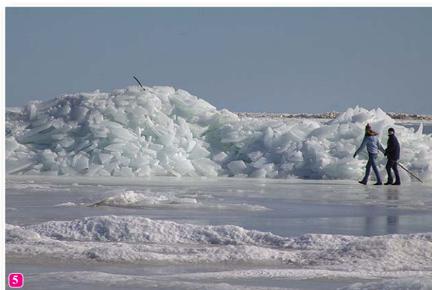
The winter by the Baltic Sea