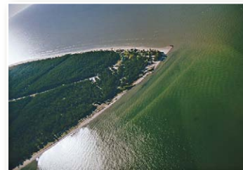
Kolkasrags (the Cape of Kolka)

www.talsurajons.lv 63224165; www.ziemeļkurzeme.lv 63232293, 29444395