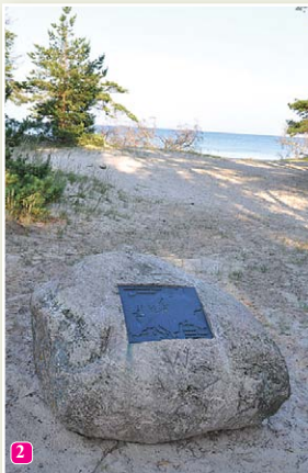
The rock marking the centre of Europe