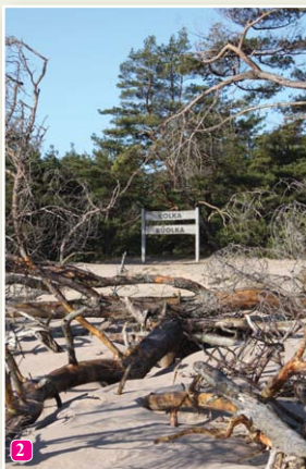
On the shore at Kolka