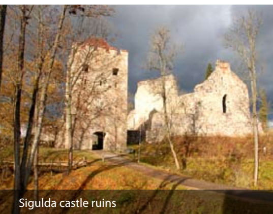
Sigulda castle ruins

Daily cycling distances: ~30-55 km (8 Days)