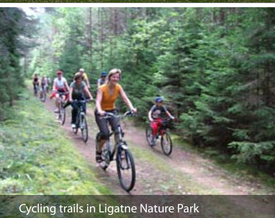
Cycling trails in Līgatne Nature Park

General Route: Rīga - Valmiera - Cēsis - Sigulda - Rīga