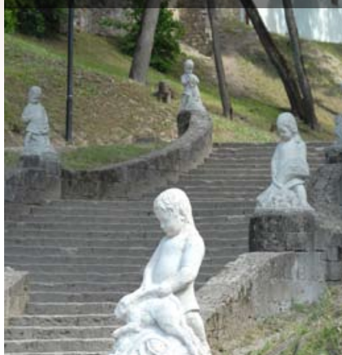
Park of The Livonian Order Castle in Cēsis