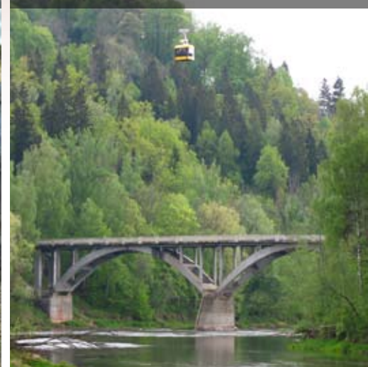
Cable car and bridge across river Gauja