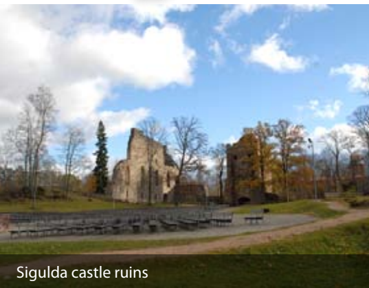
Sigulda castle ruins