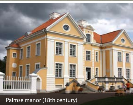
Palmse manor (18th century)