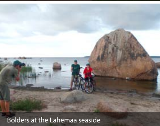
Boulders at the Lahemaa seaside

General Route: Rīga - Valmiera - Valga - Otepää - Tartu - Rakvere - Tallinn - Haapsalu - Pärnu - Rīga