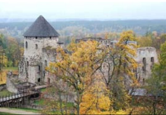
The ruins of the castle of the Livonian Order, Cēsis