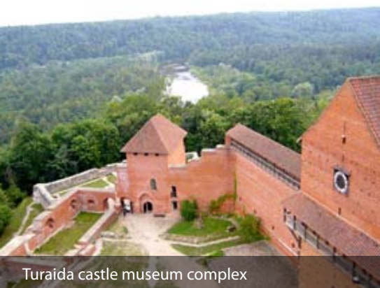
Turaida castle museum complex

General Route: Rīga – Cēsis – Valmiera – Saaremaa – Tallinn – Tartu – Daugavpils – Vilnius – Kaunas – Klaipėda – Rīga