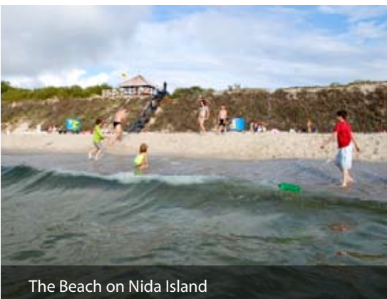
The Beach on Nida Island