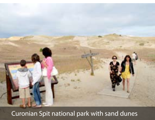
Curonian Spit national park with sand dunes

Sites and attractions en route: Daugavpils - the second largest city in Latvia and birthplace of the world famous artist Mark Rothko. Daugavpils fortress is one of the mightiest in Europe. Cross the border to Lithuania. Auk-