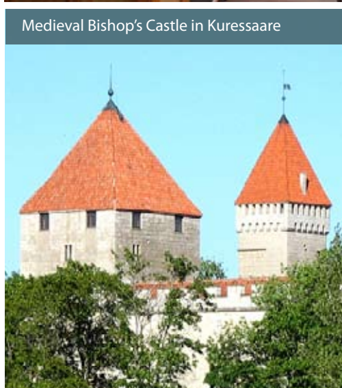
Medieval Bishop's Castle in Kuressaare