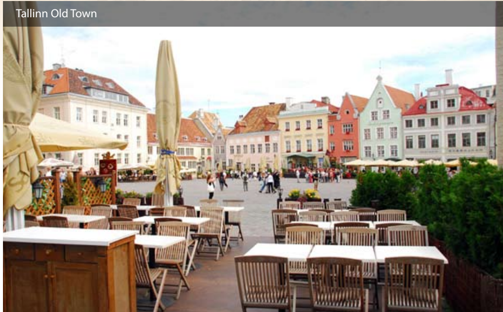
Tallinn Old Town

Breakfast. Free time in Kaunas - the former Lithuanian capital with a charming Old Town. Sites and attractions en route: Valley of the river Nemunas with beautiful vistas from various castle mounds, Cape Vente - a popular bird observation point, lighthouse, the island Rusne with a small ethnographic open-air museum. Free time in the port city of Klaipeda.