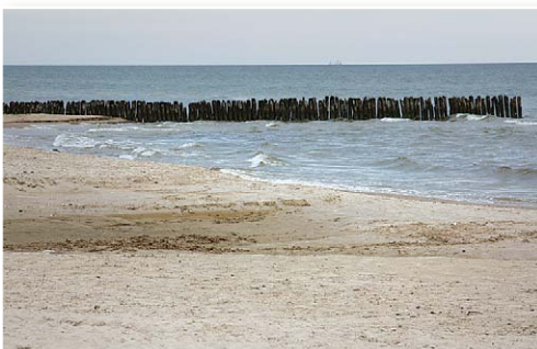
The sea at Košrags