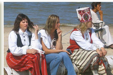
By the sea

The Slitere National Park features several other hikes, as well as bike, water and auto routes. Look for a list of routes on www.countryholidays.lv and for markings out in nature.