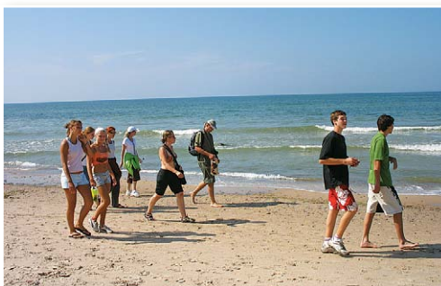
A walk along the shoreline