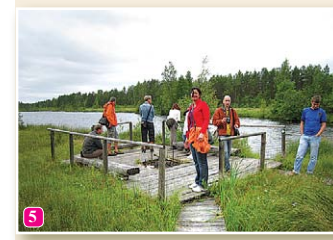
5 The Pēterezers Nature Trail