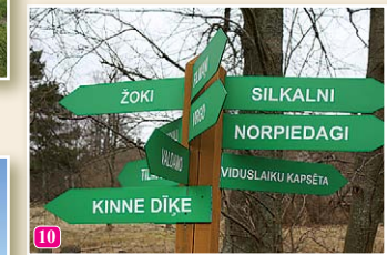
10 Košrags village