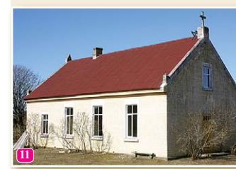
11 The Baptist Church of Pitragi