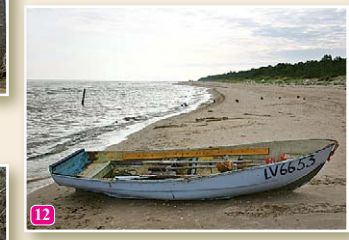
12 The sea by the Saunags