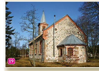
19 The Lutheran church of Kolka