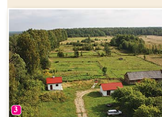
3 The view from the Slītere lighthouse