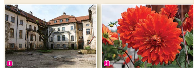
1 The Dundaga castle

The Slītere National Park features several other hikes, as well as bike, water and auto routes. Look for a list of routes on www.countryholidays.lv and for markings out in nature.