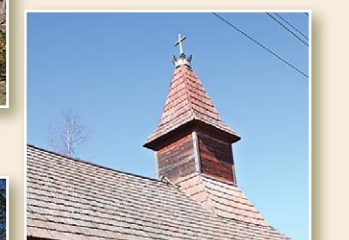
19 The Catholic Church of Kolka