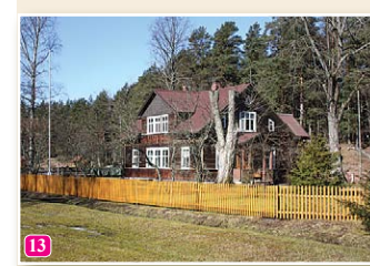
13 The „Purvziēdi” homestead in Vaide