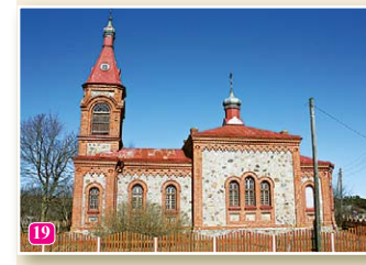
19 The Kolka Orthodox Church