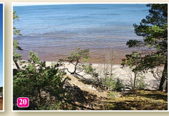
20 The Ēvazi shoreline