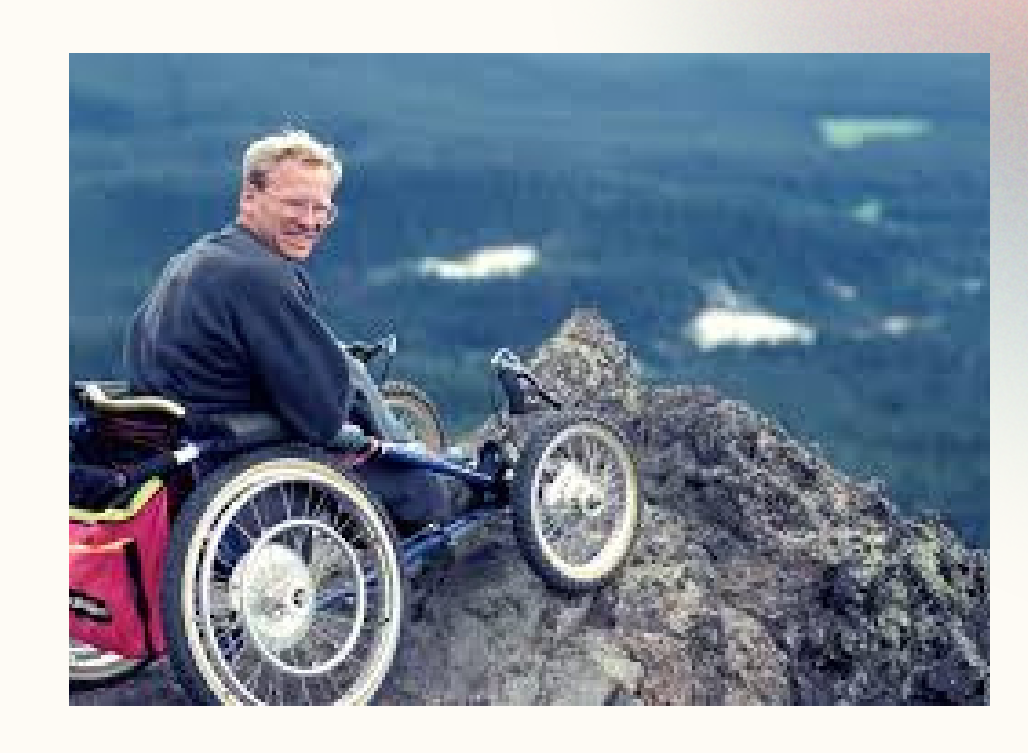
The best wheelchair for forest paths, gravel, snow, and mud in progress