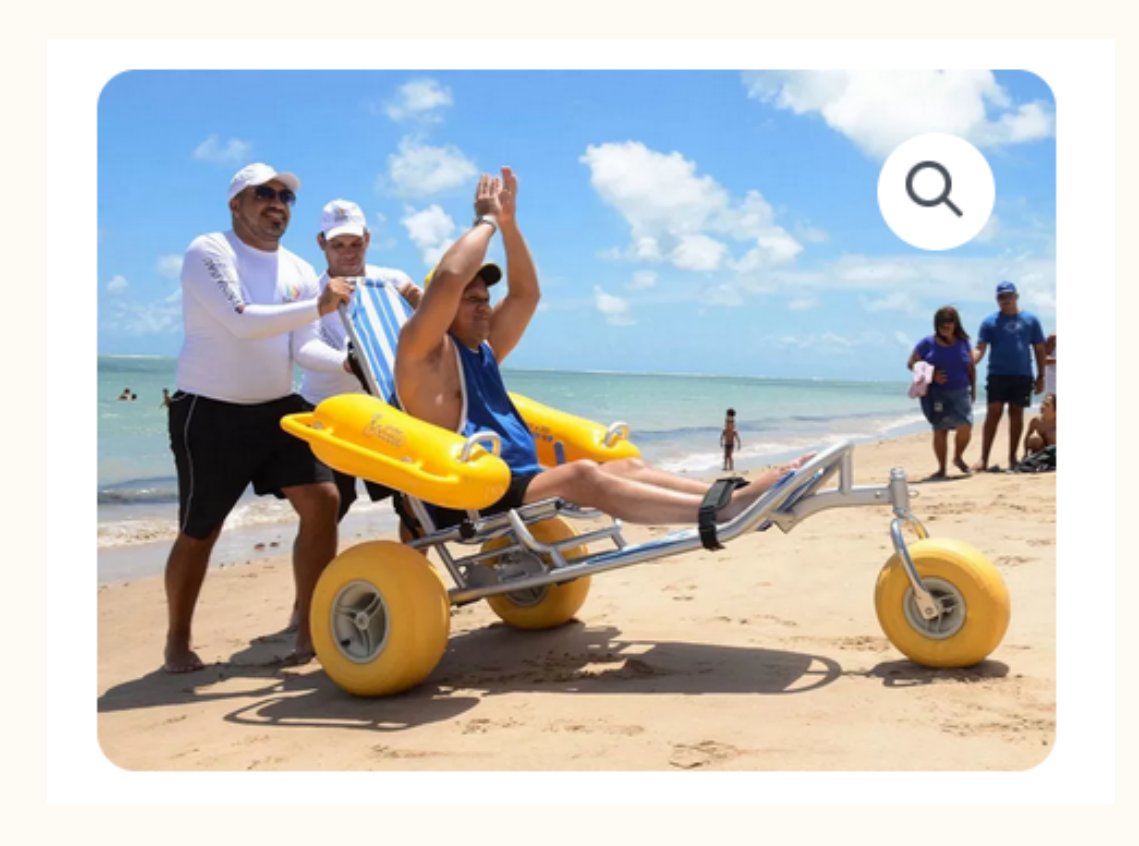
Decision about best beach wheelchairs has been made