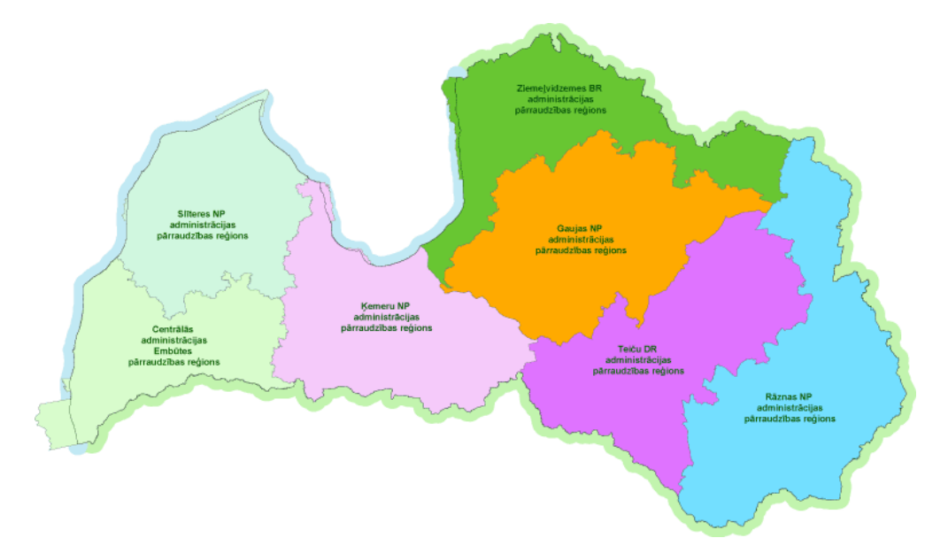
Picture 1.

The territory of Latvia has been dividend into 7 regions having one of former management bodies of NATURA2000 or nature protected areas responsible for the whole region (see Picture 1). As an example, if you want to develop tourist trail in the Ancient Abava River Valley Nature Park it has to be agreed with administration of Slitere National Park or if it is geographically closer - with administration of Kemeri National Park. The map below can be found in the website of Nature Conservation Agency.