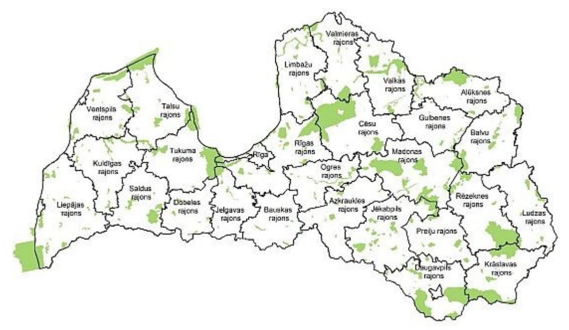
Picture 2. The NATURA 2000 sites in Latvia marked green.