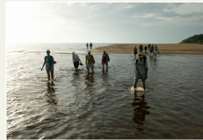
The Vitrupe River estuary