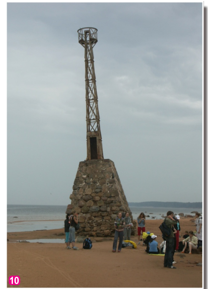
The ruins of the old Ķurmragi lighthouse