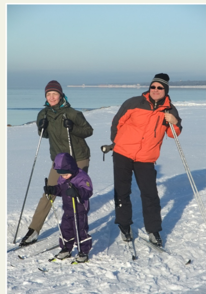
Skiing on the seashore