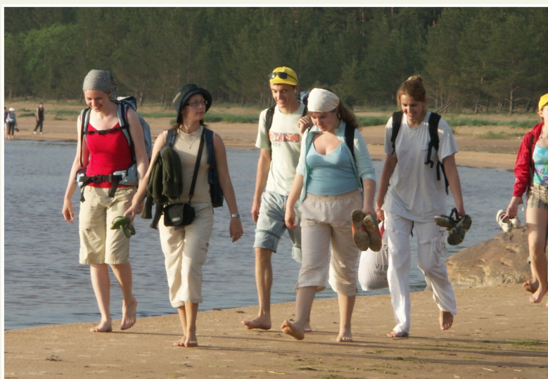
Hiking along the seashore