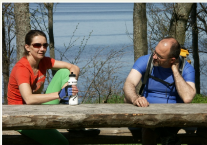
Leisure facilities on the seashore

13 The Tūja brick factory dates back to 1936. Clay from the Devonian period was used. The factory produced high-quality bricks for structures such as the Gunpowder Tower in Rīga when it was renovated. The factory remained open, with some interruptions, all the way until the late 1980s. The ruins of the factory can be seen from the Tūja village centre as you walk toward the sea.