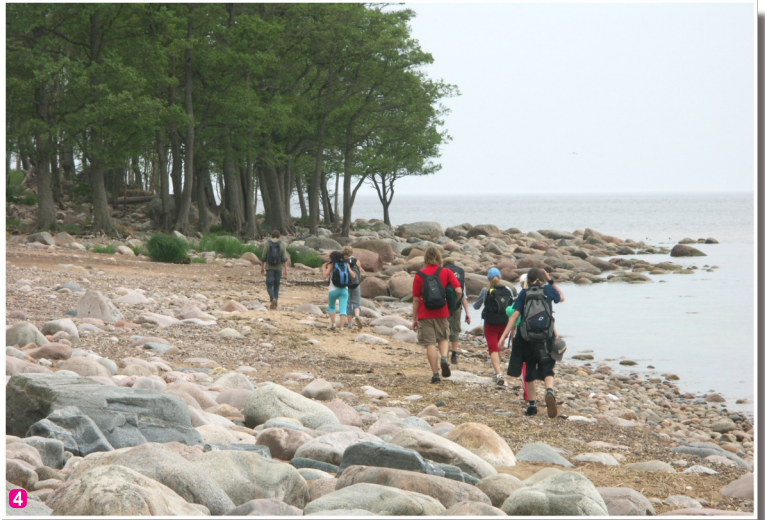
Walking along the rocky beach

The rocky seashore of Vidzeme is covered with rocks of different sizes, and there are different little capes and bays along this phase of the eastern shore of the Bay of Rīga. Between Tūja and the estuary of the Vitrupe River, you will find the only place in Latvia where the abrasive waves of the sea have unveiled Devonian sandstone cliffs that are several metres high. One of the best examples of this are the Veczemes cliffs, which are a bit less than 500 kilometres long and up to four metres high. The area around the cliffs has been improved. The shoreline is very variable and dynamic here, particularly after big storms. The Rocky Vidzeme Seashore Nature Reserve has been established to protect the area. The territory is part of the Northern Vidzeme Biosphere Reserve.