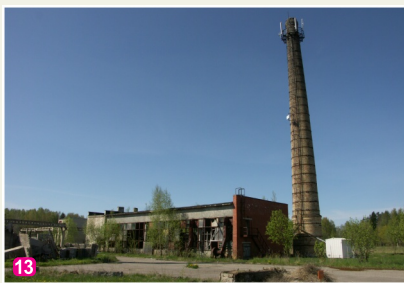
The Tūja brick factory