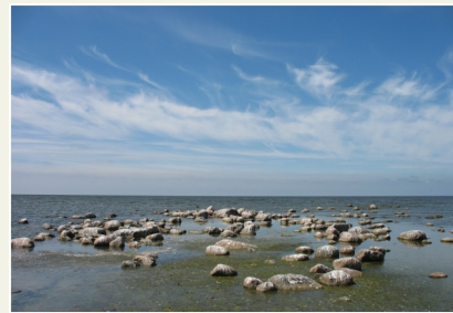
Rocks near the shore