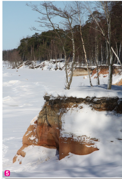
The Veczemes cliffs in winter