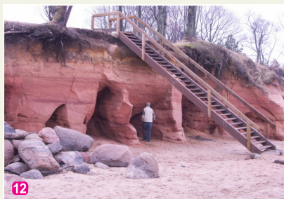
The Tūja cliff