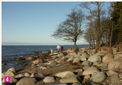
Cape Kutkāji in the spring