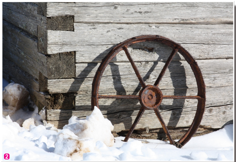
Historical buildings along the Vidzeme seashore

Look for a list of active tourism routes on www.countryholidays.lv !