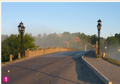
1 The Laukakmeņu (field stone) Bridge in Kandava

12 Renda , where Duke Jacob had manufacturing facilities in the 16th century. Points of interest include the Ivande Waterfalls, the Lutheran Church, the Devil’s Boat, the Lielrenda Baronial Estate , and others.