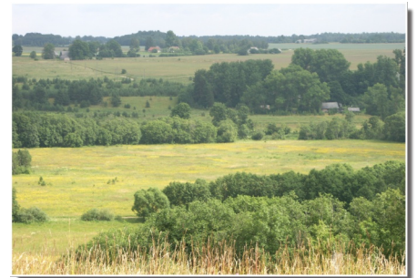
The ancient Abava river valley