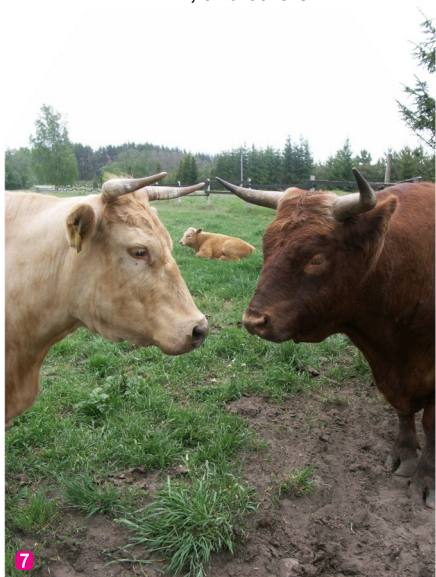
7 Livestock adapted to life in the wild near the Drubazi Nature Trail