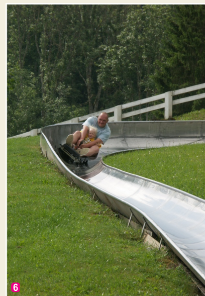
6 The ski and sliding trail at the Swedish Hat