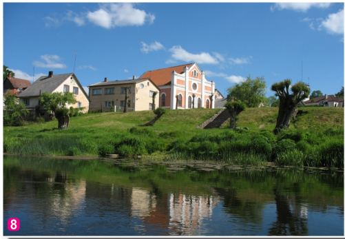
Sabile and its former synagogue