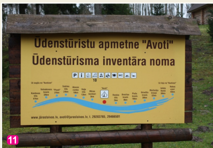
11 Avoti – “Seakayak” base on the left bank of the Abava