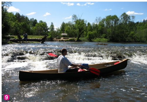
The Abava rapids