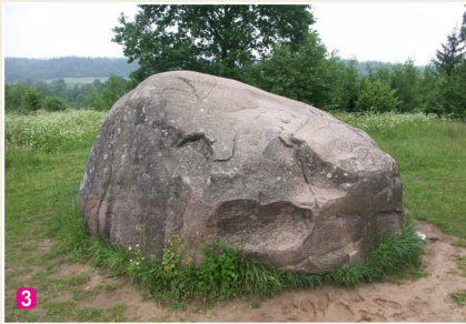
3 The Devil’s Rock in Abava