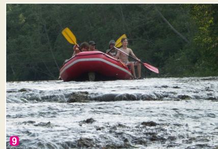
9 Boaters at the Abava Rapids