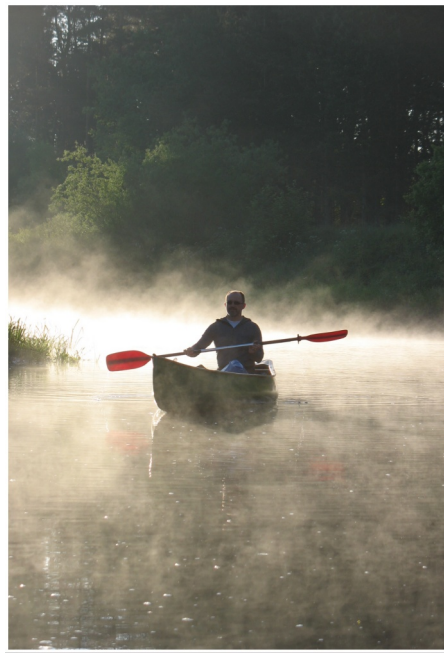
Dawn on the Abava