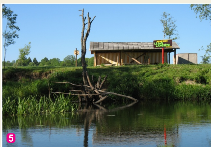
5 The “Lejas Langsēde” campsite