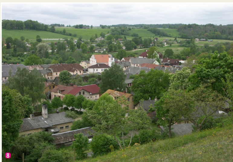
8 A view of Sabile from Wine Hill