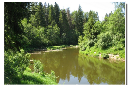
Near the end of the Abava route

Look for a list of active tourism routes on www.countryholidays.lv !