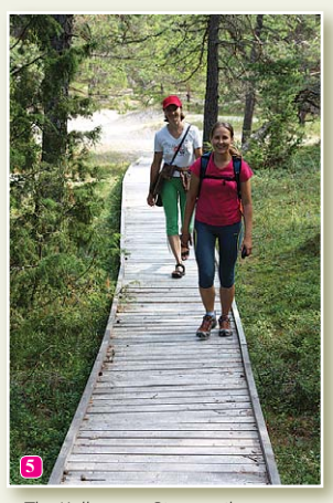
The Kolkasrags Pines trail