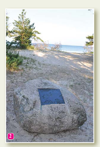
The rock marking the centre of Europe