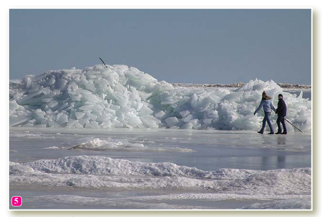
The winter by the Baltic Sea