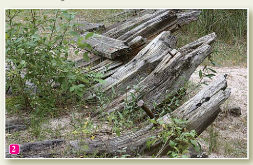
The wrecked ship