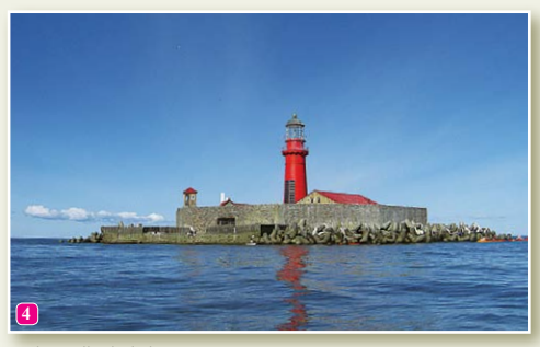
The Kolka lighthouse