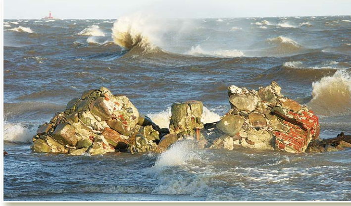
Storm at Kolkasrags

The Slitere National Park features several other hikes, as well as bike, water and auto routes. Look for a list of routes on www.countryholidays.lv and for markings out in nature.