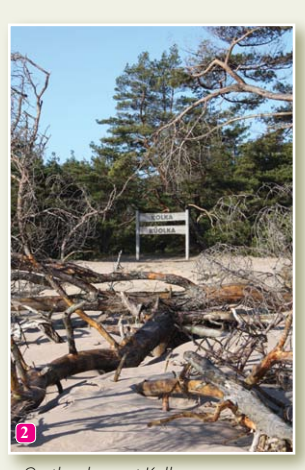
On the shore at Kolka