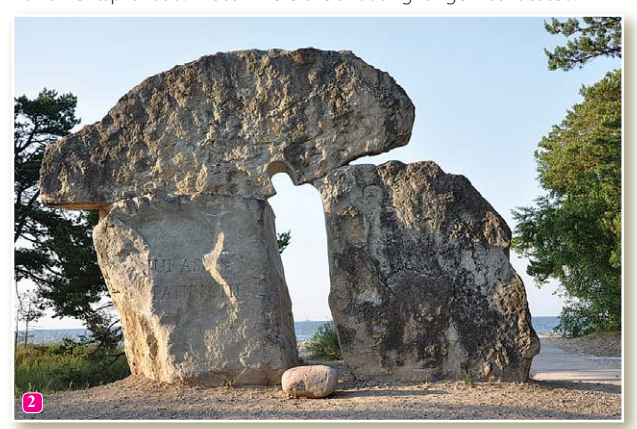
The monument to "Those Taken by the Sea"