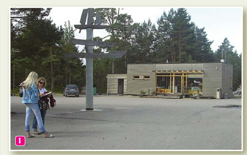
The Kolkasrags Visitor Centre