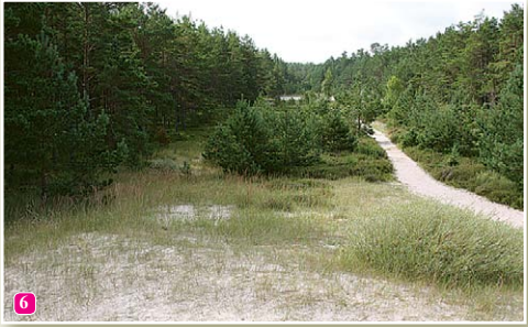
The shooting range