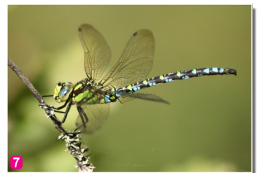
One of the largest Latvian dragonflies - the Southern Hawker male may reach 7,5 cm in length

Other routes of active tourism can be found at www.celotajs.lv !