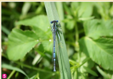
5 White-legged Damselfly