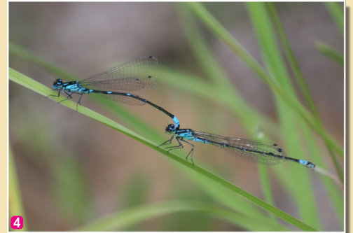
4 Variable damselfly