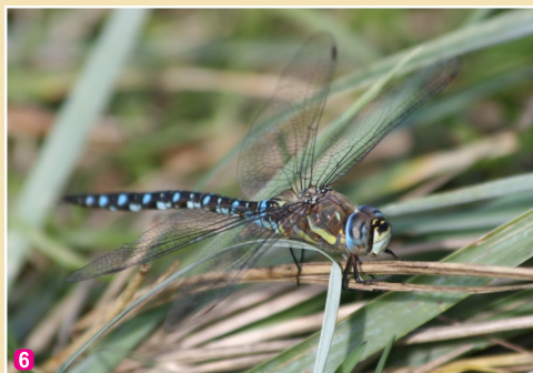
6 Migrant hawkler