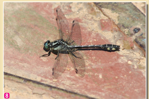
8 Common club-tail