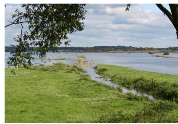
Dviete floodplain at the end of summer - when you can best of all watch dragonflies just near the water

Recommended determinant for dragonfly identification can be bought at internet stores: Dijkstra & Lewington, R. (2006). Field Guide to the Dragonflies of Britain and Europe.