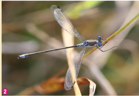
2 Emerald damselfly