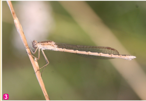
3 Siberian Winter Damsel