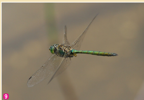
9 Downy emerald