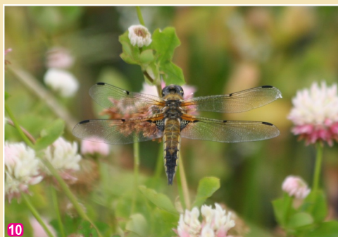
10 Four-spotted chaser