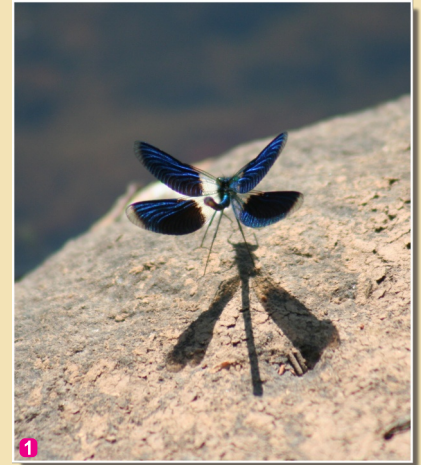
1 Banded Demoiselle