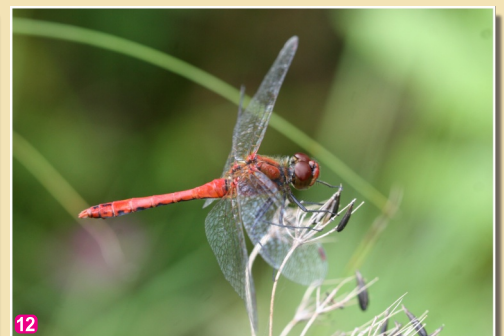
12 Ruddy darter