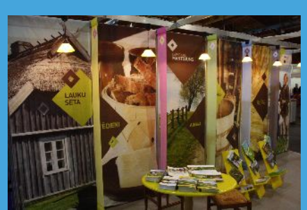
We have started a new project which is based on Latvian heritage. Within the project we will research traditional architecture, food, crafts, celebrations and people who still know the traditions. Idea is to revitalize them by incorporating into tourism product and create the tour programe "Go Local".