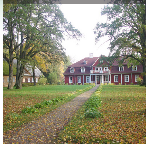
Ungurmuiža Manor and park