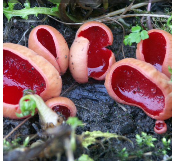
Scarlet elf cup ( Sarcoscypha austriaca )