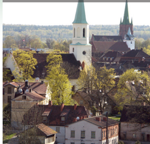
View to Talsi town