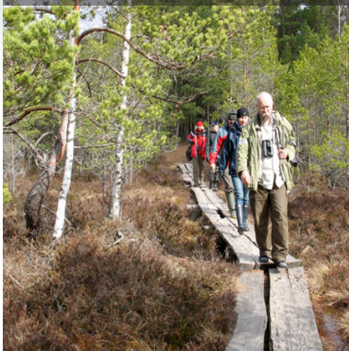
Walking Kemerī nature trail