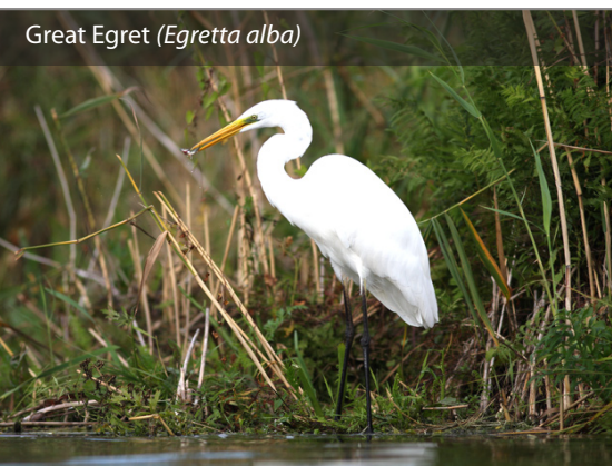
Great Egret ( Egretta alba )