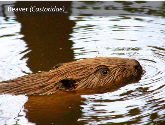
Beaver ( Castoridae )