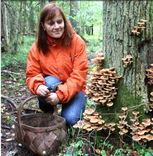
Honey Fungus ( Armillaria mellea )