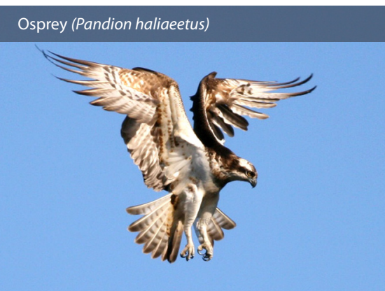
Osprey ( Pandion haliaeetus )

General Route: Rīga - Salacgrīva - Engure - Kolka - Ventspils - Užava - Kuldīga - Sabīle - Rīga