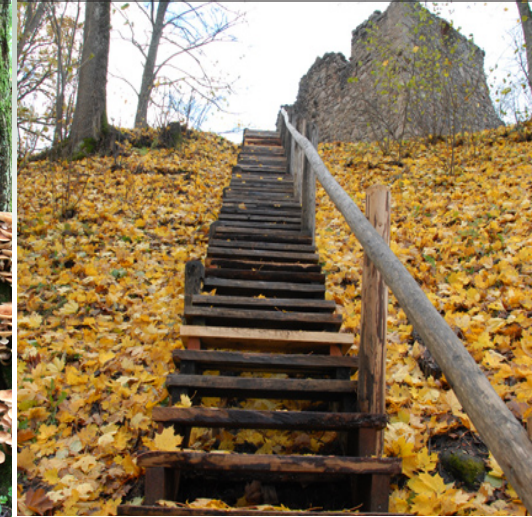
The stairs to Sigulda medieval castle ruins