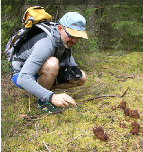
One of False Morels (Gyromitra) has been found