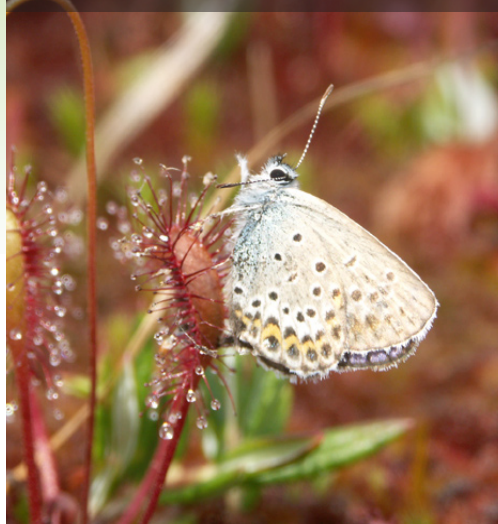
Great sundew ( Drosera anglica )