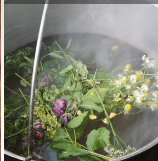
Herbal tea made from the found plants