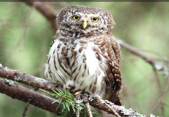
Pygmy owl ( Glaucidium passerinum )

Selected species: These territories are essential for migrating geese, different plovers, also Great Snipe, Corncrake, Lapwing and Curlews. Artificially made fish breeding ponds are great places to spot not only different types of ducks and waders but also predators like Sea Eagle, Marsh Harrier and others.