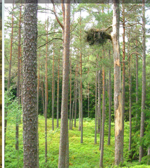
Pine forest at Slitere National Park