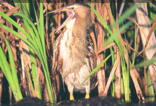
Great Bittern ( Botaurus stellaris )

Jaunmokas-Bērciems-Engure-Bērciems-Mērsrags-Ģipka-Kolka-Košrags (~195 km) Breakfast. Sites and attractions en route: an overgrown seashore with reefs - ideal places to watch wading and water bird; Lake Engure, a pasture of wild horses and cows and a birdwatching tower (the Lake Engure Nature Park); Mērsrags seashore meadows and Pekrags. A complex of lagoon-type biotopes, including meadows, areas of reeds, a rocky seashore, shoals and bird watching tower. This is a small area of wetlands located where a lagoon from the ancient Litorine Sea once was. Overnight in Košrags.