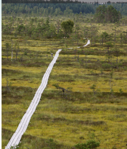
Nature trail at Ķemeri National Park