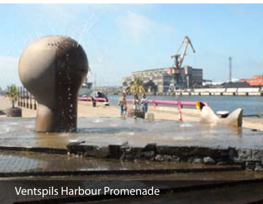
Ventspils Harbour Promenade

General Route: Rīga - Ventspils - Kolka - Pāvilosta - Ēdole - Kuldīga - Ventspils