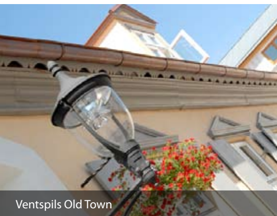
Ventspils Old Town