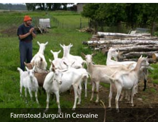
Farmstead Jurgučī in Cesvaine