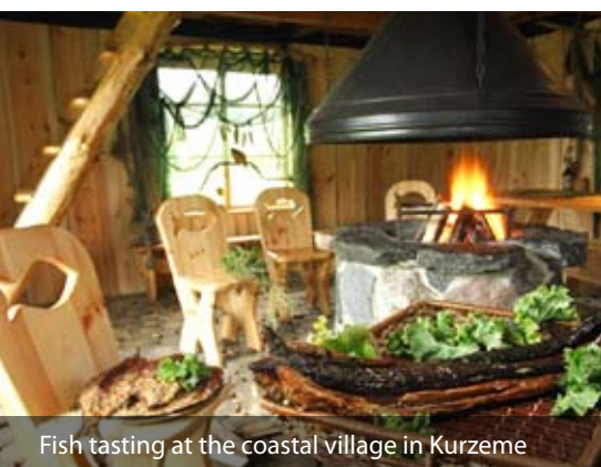
Fish tasting at the coastal village in Kurzeme

General Route: Rīga – Cēsis – Valmiera – Pärnu – Saaremaa – Tallinn – Tartu – Madona – Liepāja – Šilute – Kaunas – Vilnius – Trakai – Bauska – Rīga