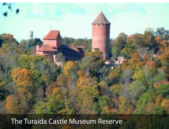
The Turaida Castle Museum Reserve