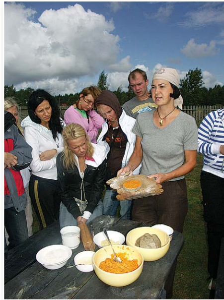
Traditional carrot buns “sklandu rauši”

4 The Kolka lighthouse is on an artificial island which was created between 1872 and 1875. The original lighthouse was made of wood, and its light was first lit in June 1987. As the island settled into the sea, the current tower was built. It began operations on July 1, 1884. Today the lighthouse is six kilometres from Kolkasrags at the end of its sandy shallows (back when it was built, it was just five kilometres away). The island still has the building for the lighthouse supervisor, as well as several outhouses. The metal lighthouse which is there now was built in St Petersburg. It has been an automated lighthouse since 1979.