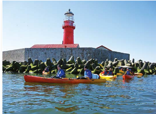
Boating group by the lighthouse