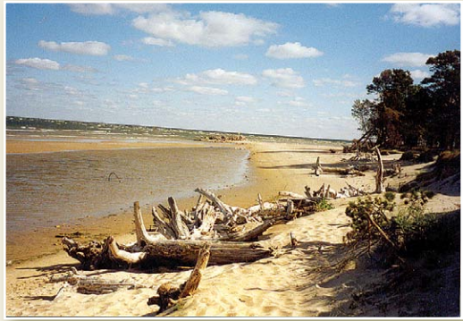
The seashore by the “Ūši” homestead

The Slitere National Park features several other hikes, as well as bike, water and auto routes. Look for a list of routes on www.countryholidays.lv and for markings out in nature.