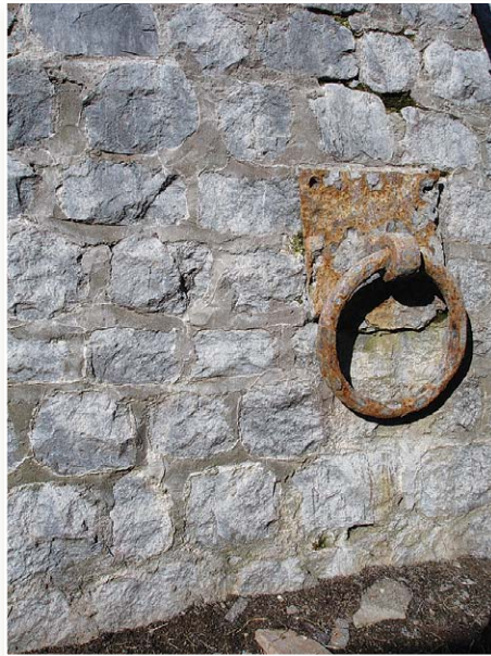
The stone wall of the Kolka lighthouse