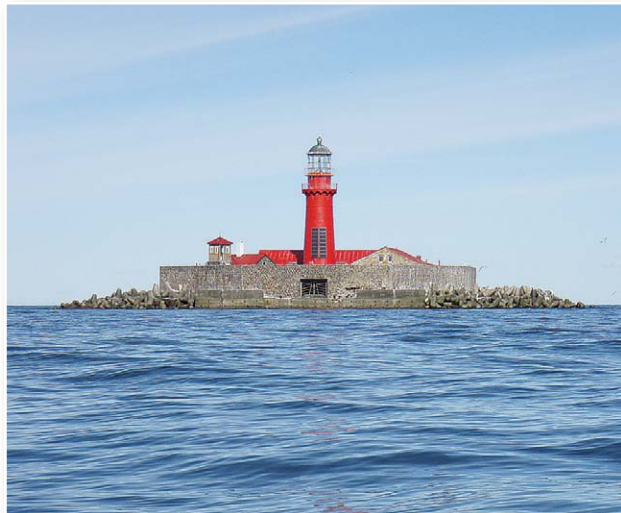
The Kolka lighthouse

By fishing boat you can go around the Cape of Kolka or the Kolka lighthouse. The route takes about 1 hour. Boats with 10 seats or with 4 seats are available. There is an option to take part in fishing with nets or traditional plaice fishing with ropes. Tasting smoked fish on the shore. Reservations: sea captain Visvaldis Feldmanis in Kolka, tel. 28327142.