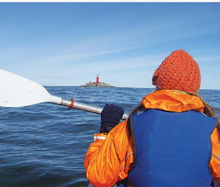
Approaching the Kolka lighthouse