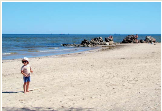
The Cape of Kolka