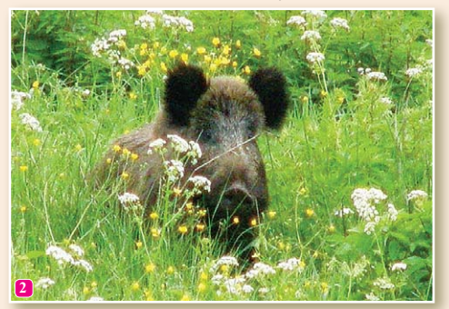
The wild board (Sus scrofa) is one of the more common large mammals in the park. During the spring it feeds out in the open and can be easily spotted.