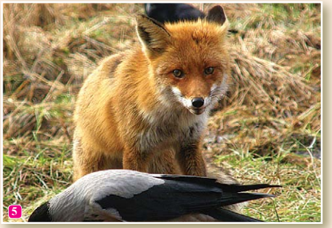
The fox (Vulpes vulpes) can be seen hunting mice in fields and meadows during the spring. The fox has outstanding