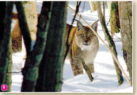
The lynx (Lynx lynx) is a very cautious animal - the only wild feline in Latvia. It is a myth that the lynx jumps on people from tree branches – it hunts on the ground.