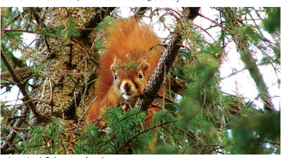
A squirrel, Sciurus vulgaris Slitere National Park features several other hikes, as well as bike, water and auto routes. Look for a list of routes on www.countryholidays.lv and for markings out in nature

Animal-watching at the Slītere National Park is only possible in the presence of a guide, and only for small groups of one to five people (the park asks that children under the age of 15 not be brought along). The process involves sitting around in special towers for several hours, which is why such tours are offered only when the temperature is above 0°C. You must bring water-resistant and comfortable shoes, warm and "guiet" apparel (it doesn't crinkle or make other noise, and it is not in a noisy colour). You will be walking around 2 km. Bring binoculars, a camera, snacks and non-alcoholic beverages. You must apply for an animalwatching tour at least two weeks in advance. Contact "Lauku Celotājs" on +371-6761-7600, or write to lauku@celotais.lv.