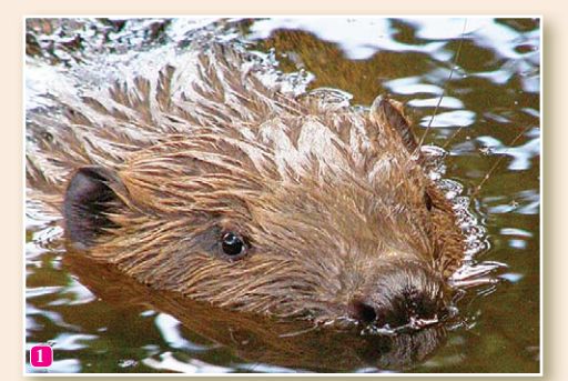
The beaver (Castor fiber) lives throughout the Slītere National Park and actively transforms its environment. The animal can be seen and heard from a distance of just a few metres.