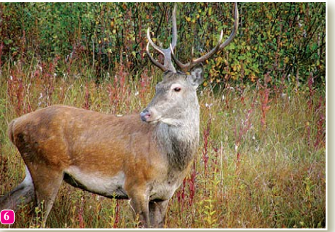
The red deer (Cervus elaphus) represents the largest population of deer in the SNP. During mating season, you can hear the bulls roaring and battling it out with their horns. That is something which every nature lover will remember for all time

The European roe deer (Capreolus capreolus) is the smallest deer in Latvia, and it is hunted by the lynx and the wolf in the Slītere National Park