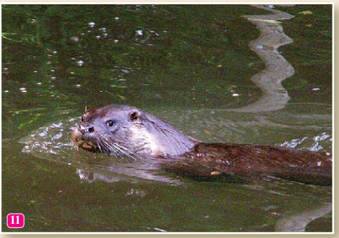
The otter (Lutra lutra) finds food in trout streams. During the summer it is a 24/7 anima