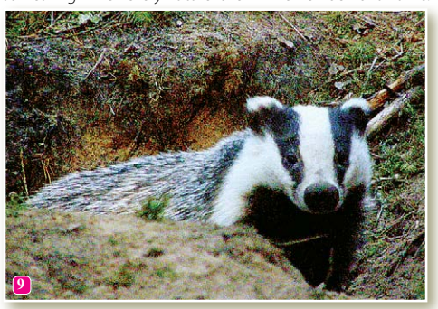
The Eurasian badger ( Meles meles ) is akin to the stoat and the ermine. Most of the year the badger comes out only at the night, but in early summer, when its young are waiting for their parents in the cave, they sometimes appear during the daytime, too. to be spotted up at the top of trees.