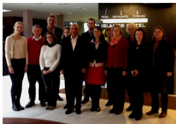
Fair Tourism Project Partners

The duration of the project is two years, running from 1 st , September; 2014 to 31 st , August 2016.