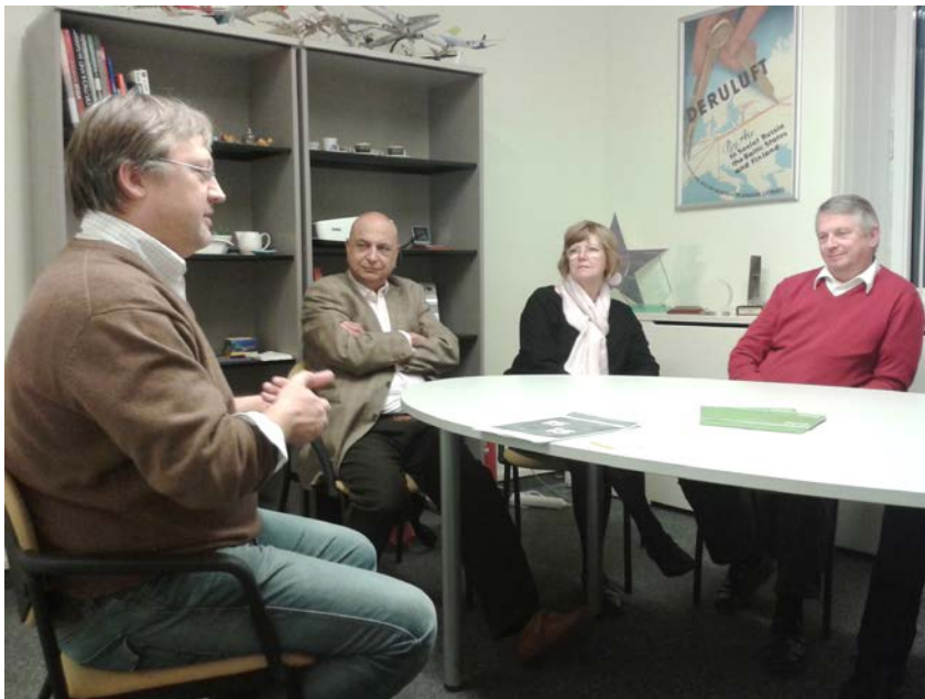
Visit to local CSR best practice example, Riga's travel company Carson Wagonlit Latvia

and understand the Work Packages and Deliverable Outcomes to be completed by the target dates set. Each project partner was set specific roles and responsibilities to be delivered prior to the next meeting.