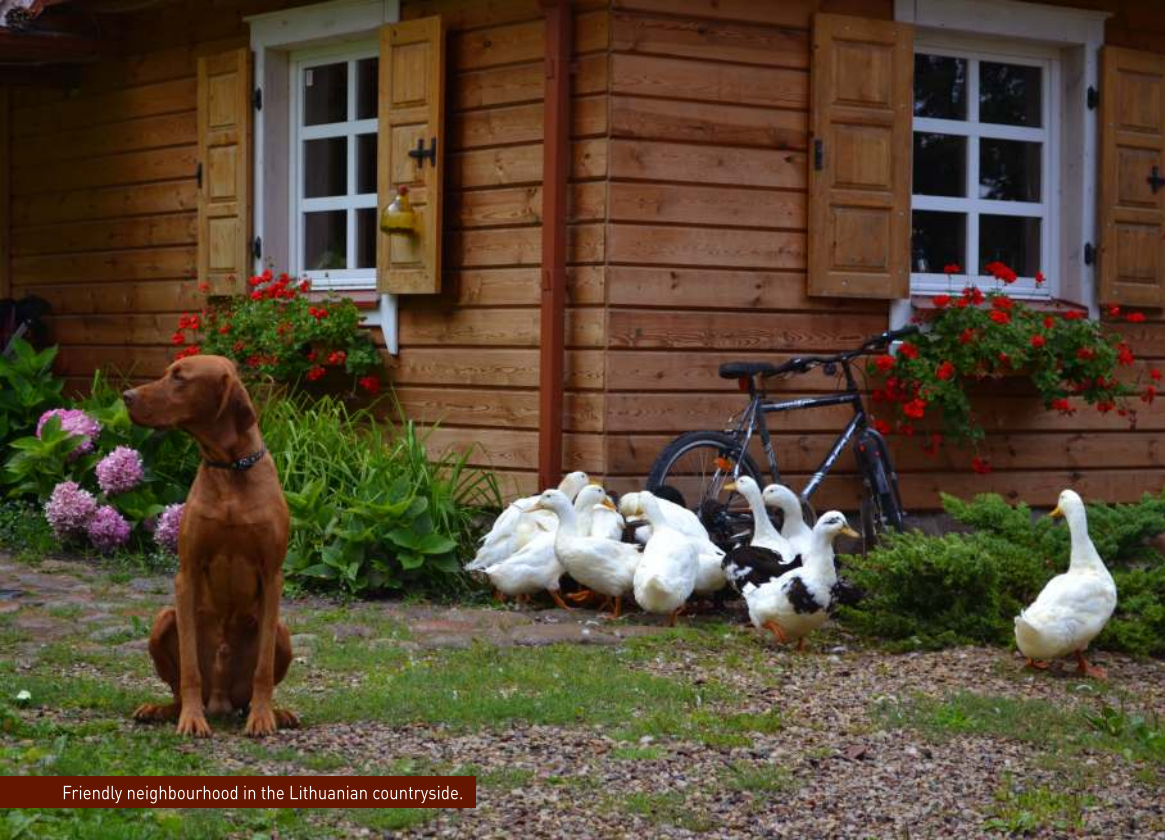
Friendly neighbourhood in the Lithuanian countryside.