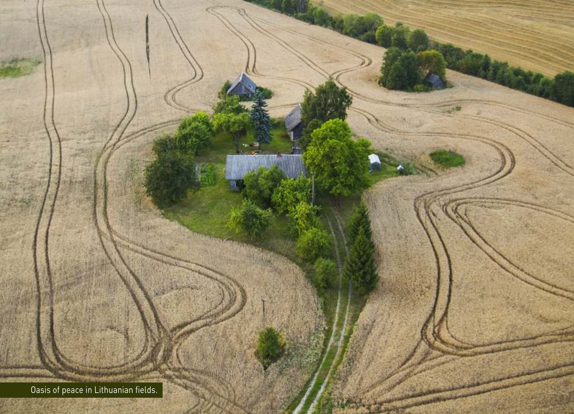
Oasis of peace in Lithuanian fields.