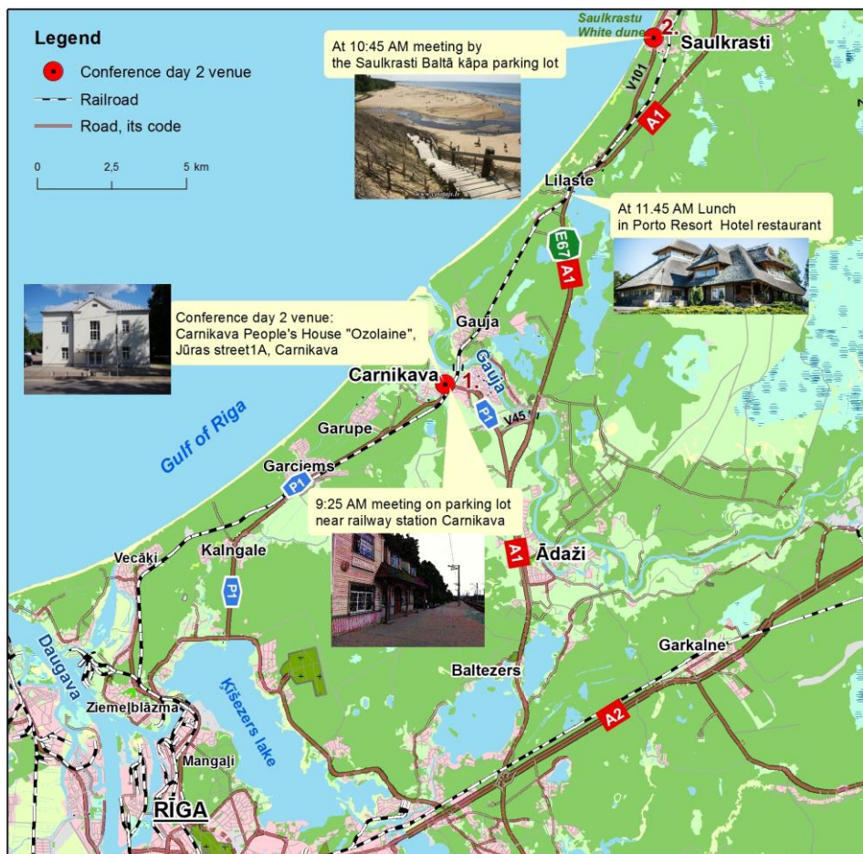
Picture: overview map of the 2 nd day